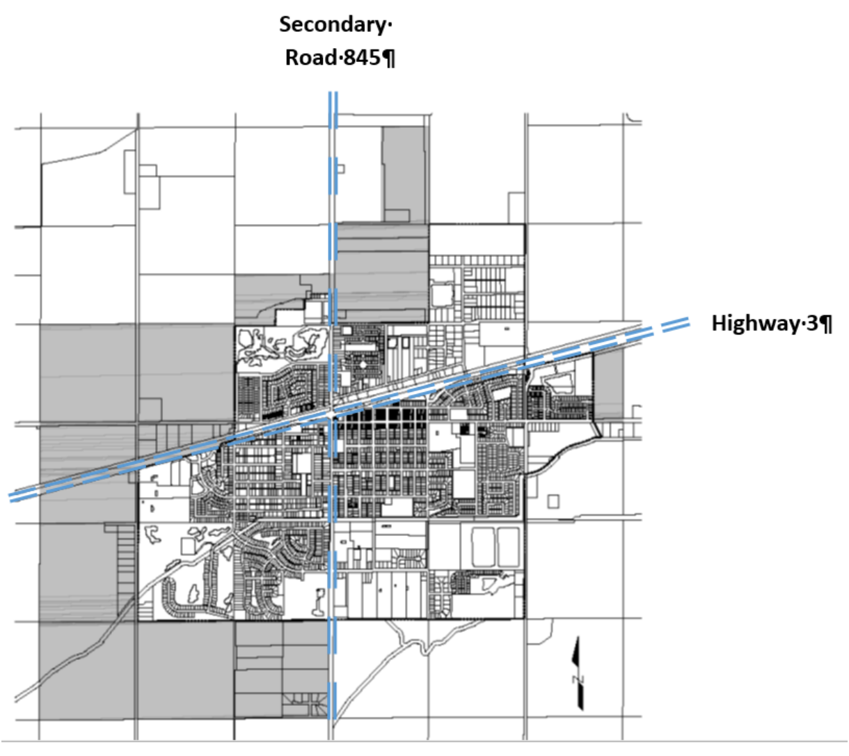
Map 3: Location of Highway 3 and Secondary Road 845