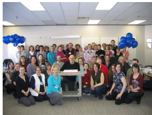
Polaris Celebration! Library Managers' Council - Feb. 18, 2009

We have been receiving comments from our partner library managers, that use in rural public libraries is also up over the year before. Provincial Budget is coming down sometime in April and no matter what, I still see good things happening for libraries in the province. We have been advocating to provincial and municipal politicians and we are being heard. We must continue let them know that the library card is good for much more than just borrowing books from the library.