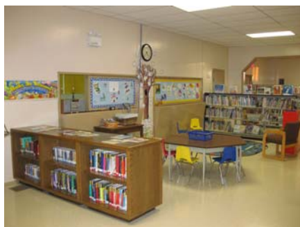
The New Alice Melnyk Public Library!